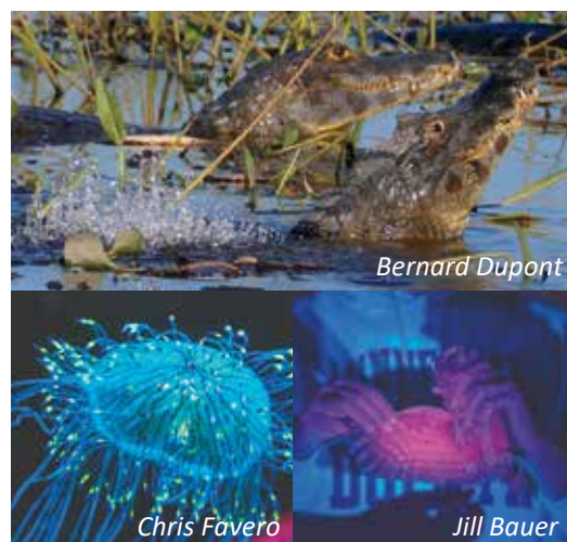
Top: Vibrations produced by the alligator family cause water to "dance." Bottom left: Jellyfish light up to communicate with one another and confuse predators. Bottom right: Under ultraviolet light, the feathers of Saw-whet Owls glow pink.

As you explore the outdoors this winter, stop to look, listen and sniff for signs of animal language. Are there bobcat scent marks on trees, coyote pheromones on the trail and winter bird song on the wind? As spring approaches, the St. Croix River Valley will reverberate with the sights, sounds, and smells of animal language if we only stop to listen.