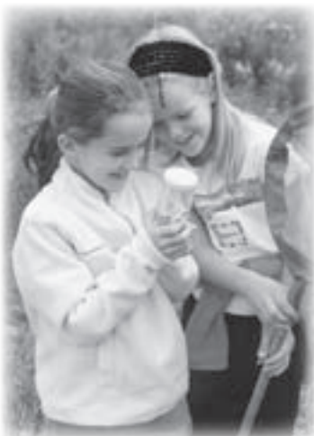
Nature & science really come alive for students during a visit to CNC.

dates. We will continue to be everyone’s outdoor classroom, their nature escape, their quiet hiking spot, and their birding place. We literally have miles of trails with wonderful views. We hope you will join us in our exploration.