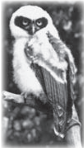
Come and meet this young Spectacled Owl who is now all grown up.

Over 200 different species of owls share our earth. Meet several exotic owl species while learning the importance of their existence. Come and see owls from all over the world! You will even see the largest owl species in the world and meet a free-flying "ghost owl". Space is limited; reservations required. Program fee: $8.00 per person or $5.00 for "Friends of CNC".