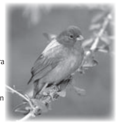
Painted Buntings are just one of the 150 bird species eco-tour participants will get the chance to see in Jalisco.