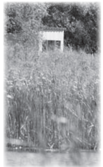
Eagle Scout Nathan Kintzi completed the wildlife watching blind on CNC’s wetland.