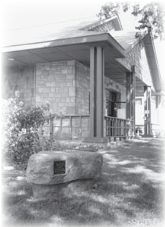
A granite bench was dedicated in honor of David & Su Southwick's 50th wedding anniversary from their loving sons.