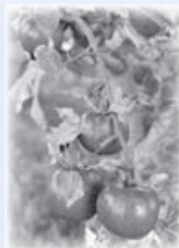
CNC's orchard has over 14 varieties of apple trees all managed with minimum-spray, eco-friendly techniques.

Bird banding records can help us learn how long birds live, where they travel, when and where they migrate and many other interesting facts. Carpenter Nature Center's bird banders capture, record, band and release songbirds. This is your chance to see songbirds up close. There is no admission fee, but please call ahead (651-437-4359) so we know you are coming. Donations of sunflower seed and suet are welcome.