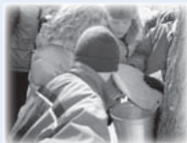
Visitors examine the sap during a maple-syruping program.

Welcome the coming of spring by joining the CNC staff in the tradition of making maple syrup. We'll hike to the “sugarbush” to tap maple trees, witness the process of turning sap into syrup and sample the finished product. This program will start indoors, but be prepared to hike in the spring snow and mud. Program fee: $5.00 per person or $3.00 for “Friends of CNC” and children under 10.