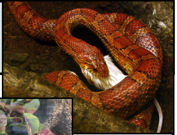
Upper: adult Corn Snake feeding on a mouse.