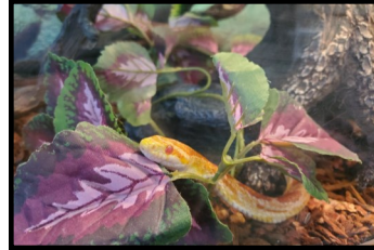
Left: CNC's Corn Snake

Description: Non-venomous and mild-mannered. Large brown and red-orange spots run along the back side of the body, while the underside typically has a black and white checkered pattern. The average adult commonly ranges in length between 18-44 inches, with males usually being larger than females.