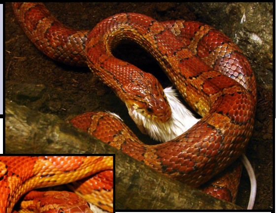
Upper : adult Corn snake feeding on a mouse.

Description : Non-venomous and mild-mannered. Large brown and red-orange spots run along the back side of the body, while the underside typically has a black and white checkered pattern. The average adult commonly ranges in length between 18-44 inches, with males usually being larger than females.